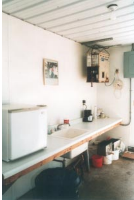
Prep room in a 7'x14' calf barn. Contains a refrigerator, a sink with hot and cold running water, and a space heater.

Save labor costs. The amount of labor you will save by building an on-site prep area depends on the number of calves fed, the number of trips made each feeding and the distance traveled. The pay-back time when investing in an on-site prep area depends on the actual labor, and construction costs. When building a new calf barn, the additional cost for a prep room is moderate, and the pay-back time is short. With outdoor